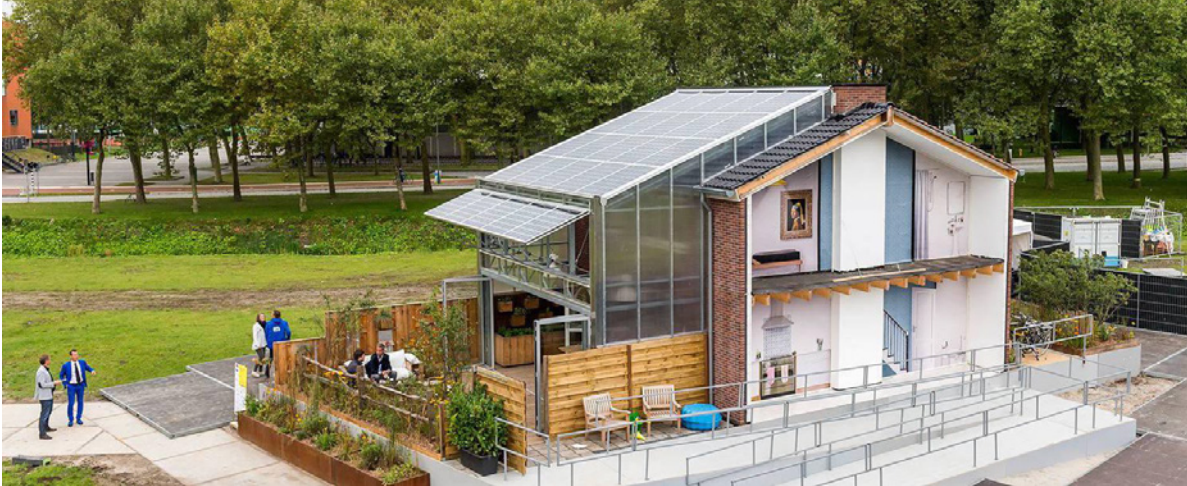
Fig. 4.1 : 1:1 Prototype of the Prêt-à-Loger house at the TU Delft Campus.

The Prêt-à-Loger house had an increased appraisal value of €37,000 compared to other renovations achieving around €5,000–€10,000 increase, mainly because of the additional space the renovation provides. Such an increase is of positive influence on the feasibility of the renovation particularly for homeowners, who can make use of additional mortgage. Banks consider characteristics such as an increase in appraisal value a key part in their risk assessments [18]. The valuation of our design shows a promising appraisal value, the costs however are still considerably higher than the increase in value, forming a clear barrier towards realisation.