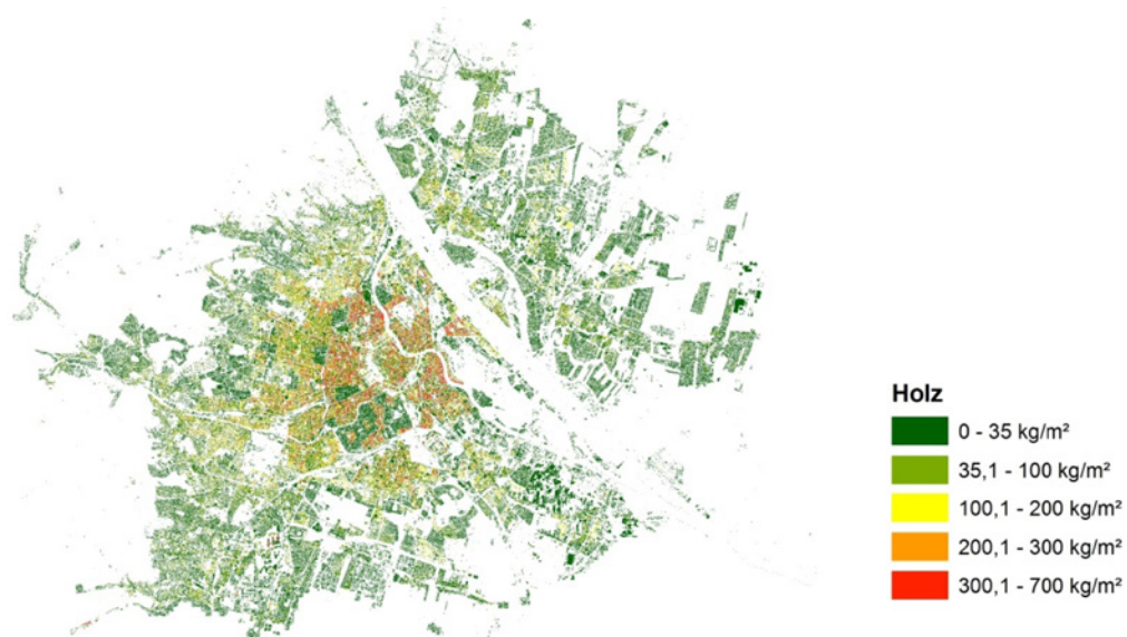
Figure 3 Spatial distribution of wood in the city of Vienna (kg/m² built-up area).