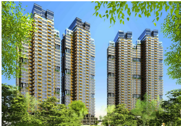
Fig. 1: The studied high-rise private residential building project (the photo is provided by developer).

The studied building is a high-rise residential building in Hong Kong to provide about 3,500 apartments. The buildings are 30-35 floors with eight apartments on one floor. A photo of the studied project is shown in Fig. 1. The project applies a precast façade that represent about 6% of the total concrete volume. In this study, a precast façade element in the studied project is compared with a hypothetical cast-in-situ façade element.