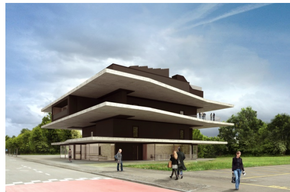
Fig. 1: Empty NEST backbone.

Once built, units will be scientifically evaluated by the partners and they serve as platforms for new research and innovation projects. All units are designed in such a way that most of the new components can be improved over time as new knowledge is gained from the operation. Once the unit has reached a level of maturity where the key questions have been answered and the technology is ready to be implemented in the market, the unit will be dismantled and replaced by a new unit with a new topic and new challenges.